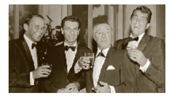
"A political satirist's job is to draw blood. I'm not so much interested in politics as I am in overthrowing the government." – Mort Sahl

USA 1989, 87 min Writer/Director: Robert B. Weide Tue. May 6 > 10:00pm > AG